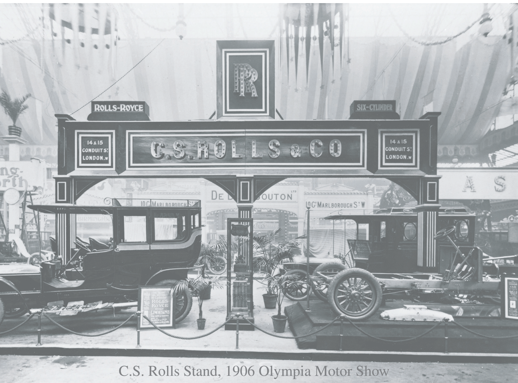
C.S. Rolls Stand, 1906 Olympia Motor Show