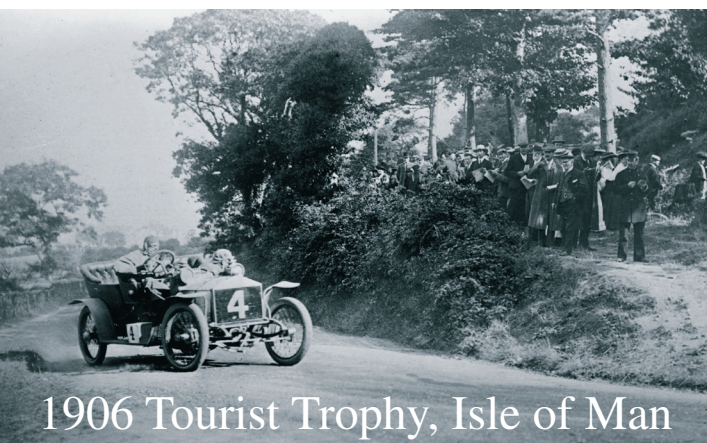
1906 Tourist Trophy, Isle of Man